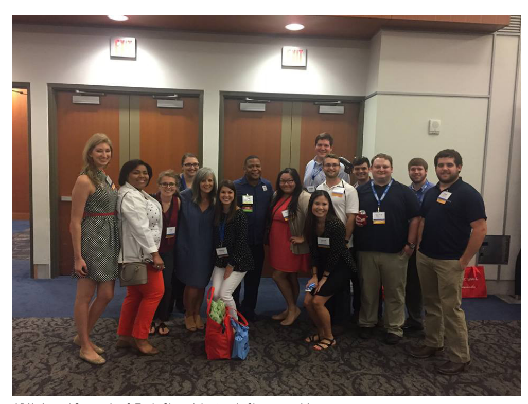
LPA's Annual Convention & Trade Show July 13-15 in Shreveport, LA.