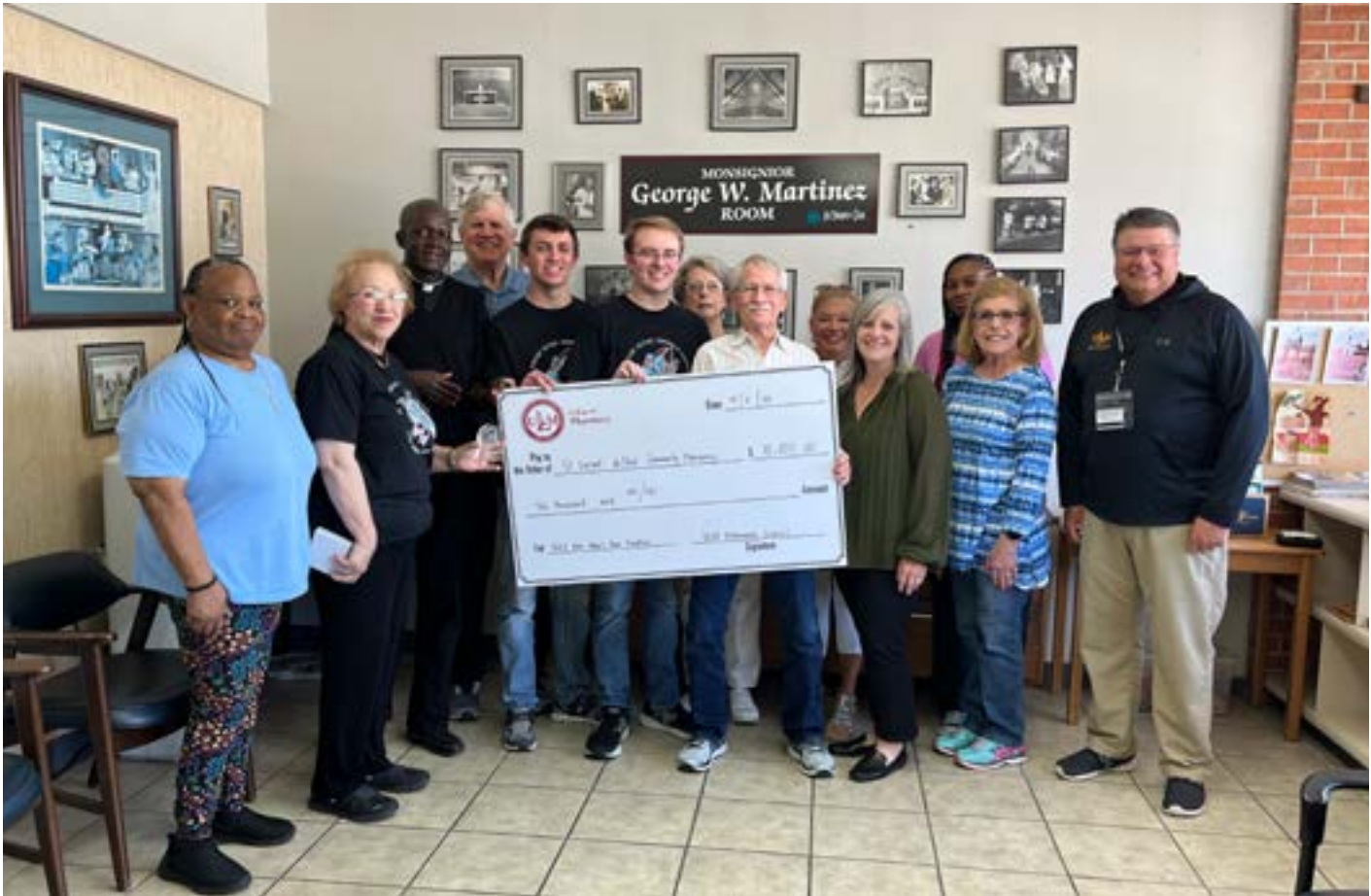
Representatives from the College of Pharmacy were able to present St. Vincent de Paul Community Pharmacy a check for $10,000, representing the proceeds from the Sixth Annual Poor Man's Run. The COP Student Council puts in countless hours to make the run successful, and this year was no different, with a record-breaking $10,000 raised.